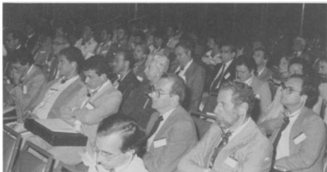
Participants at one seminar use headsets to listen to simultaneous translations.

Approximately 270 persons attended a series of five one-day seminars on edible oil processing held throughout South America earlier this year with speakers from Harshaw Chemie BV of The Netherlands, Harshaw/Filtrol in the United States, Alfa Laval in the United States and LFC (Liquid Filtration Consultants) of The Netherlands.